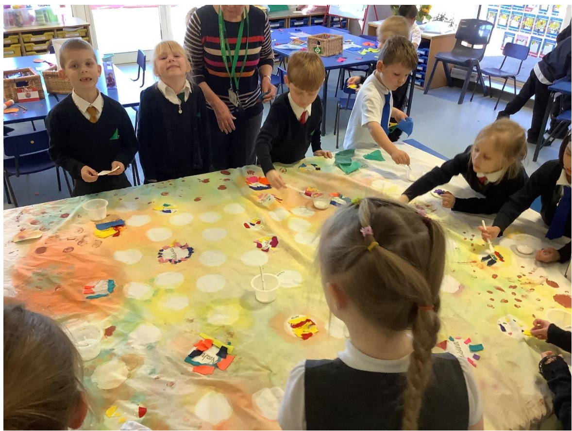
During Art and DT lessons, Year 1 created a dragon linked to the narrative of George and the Dragon.