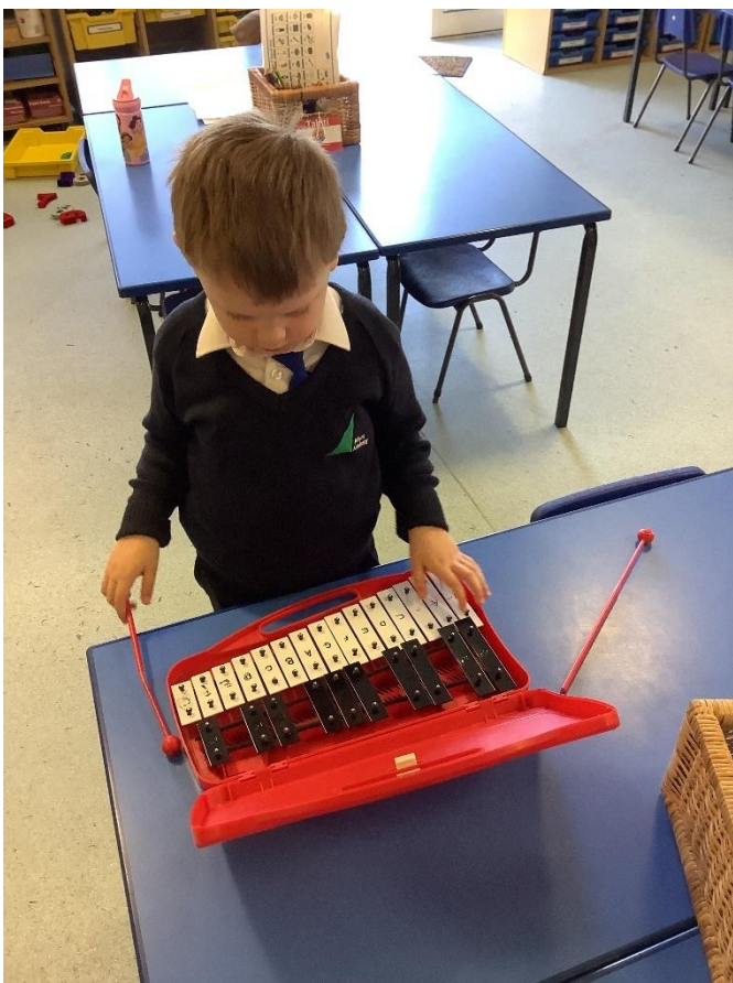
Year one enjoyed using the xylophones!