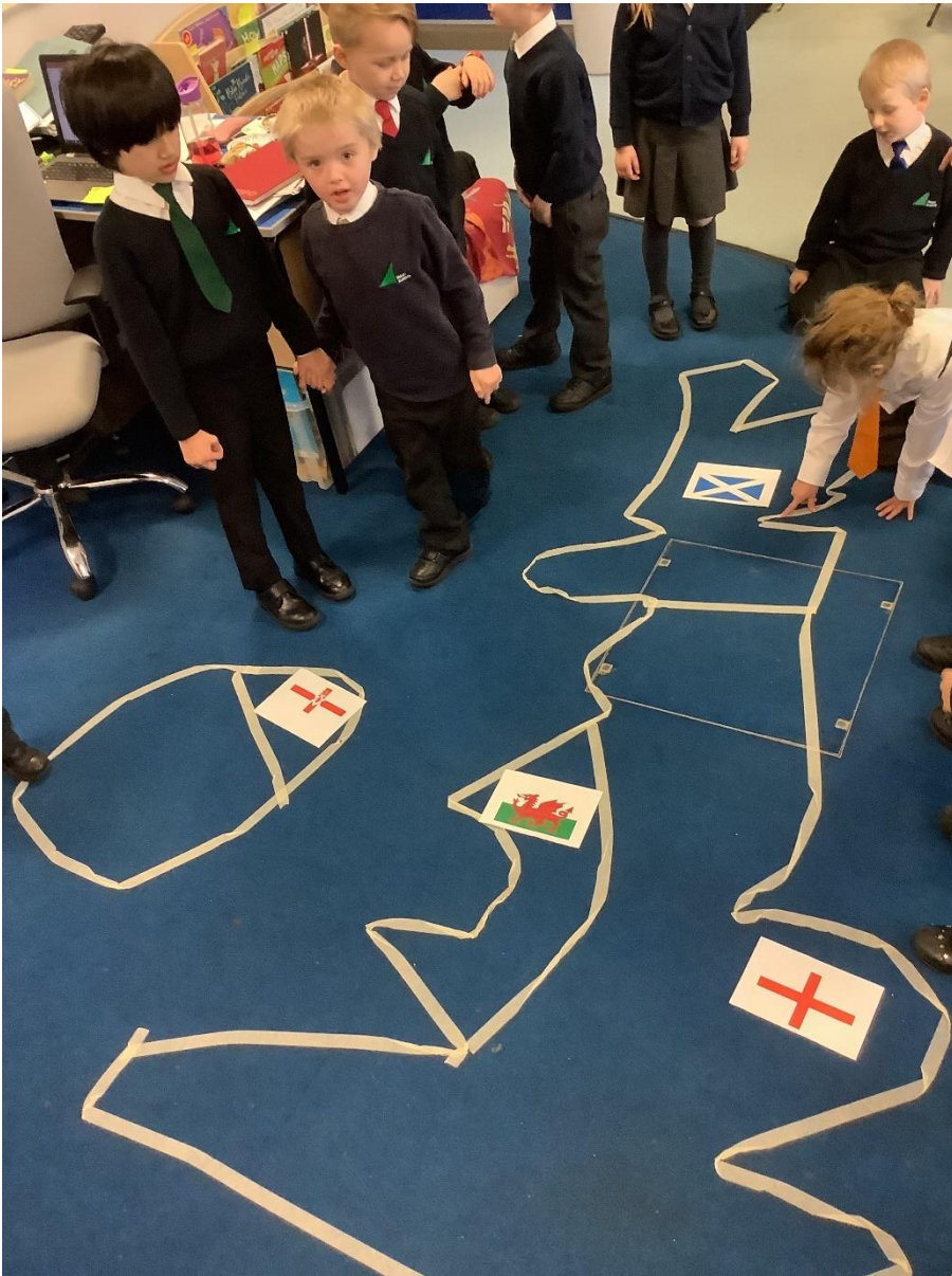
Geography lessons learning about the British Isles.