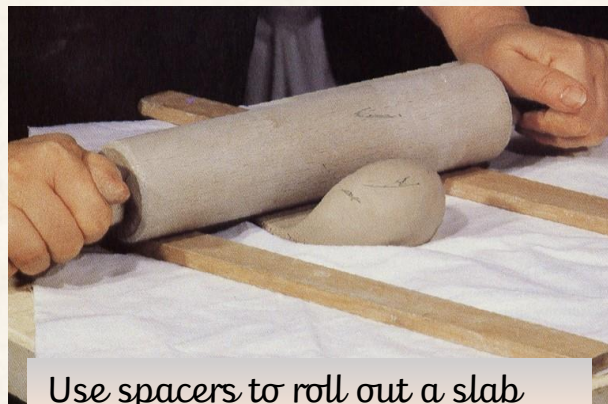
Use spacers to roll out a slab