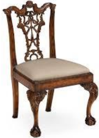
Chippendale – Ribbon back chair (Rococo)