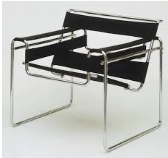
Breuer – Wassily Chair (Bauhaus)