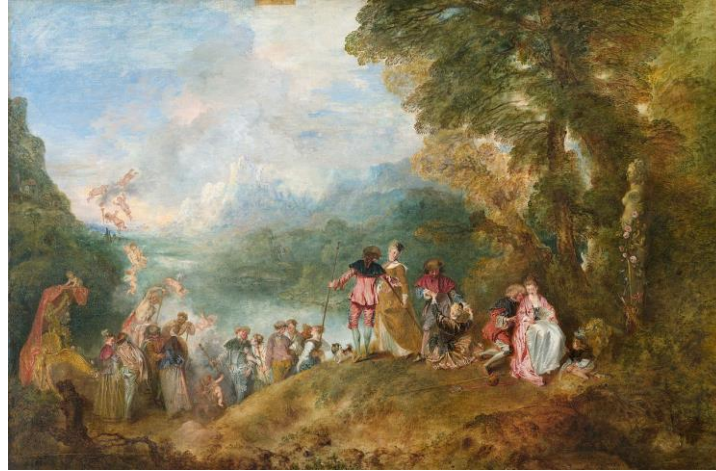
Antoine Watteau, 1684-1721 The Pilgrimage to the Isle of Cythera