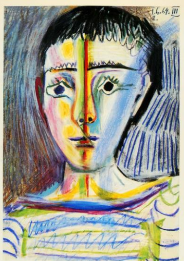
Pablo Picasso - Cubism