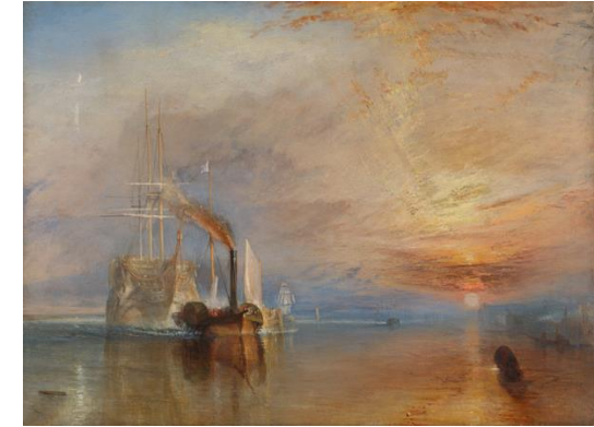
Turner – The fighting Temeraire