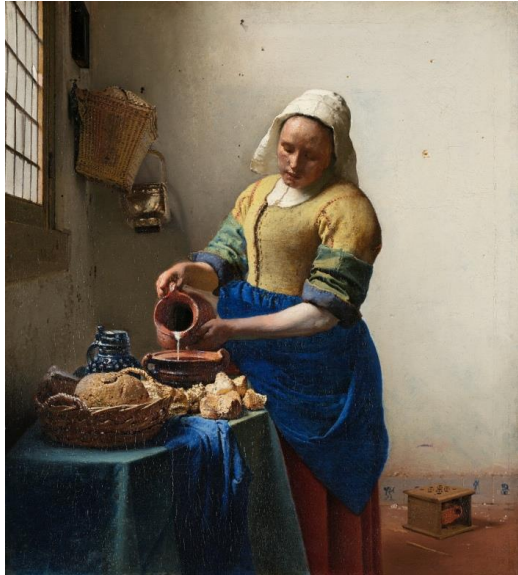
Vermeer - The Milkmaid

Ground: preparation layer on canvas (paint) or board (gesso)