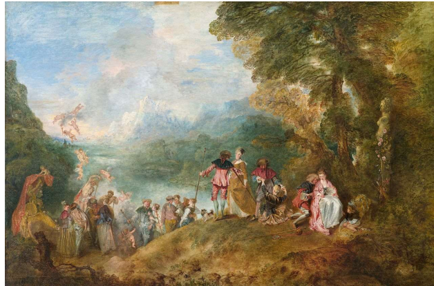
Antoine Watteau, 1684-1721 The Pilgrimage to the Isle of Cythera