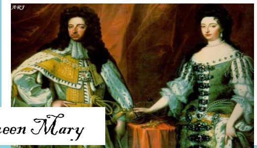
King William and Queen Mary