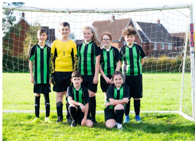
Nelson Rangers and Nelson United they played in the Downham Market Cluster Games